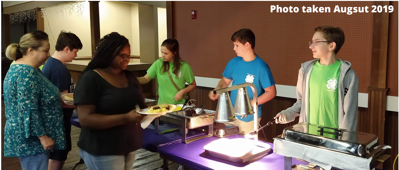
Photo taken August 2019